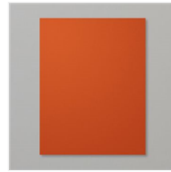
Cajun Craze 8-1/2" X 11" Cardstock - 119684