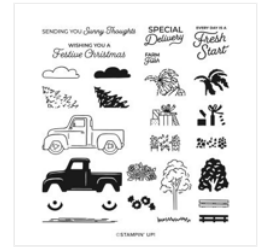
Trucking Along Photopolymer Stamp Set (English) - 162299