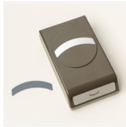
Curved Label Punch - 162273