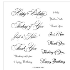
Go To Greetings Cling Stamp Set (English) - 158763