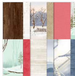
One Horse Open Sleigh 6" X 6" (15.2 X 15.2 Cm) Designer Series Paper - 162118