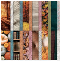
All About Autumn 6" X 6" (15.2 X 15.2 Cm) Specialty Designer Series Paper - 162178