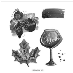
Cheers To The Season Cling Stamp Set (English) - 162309