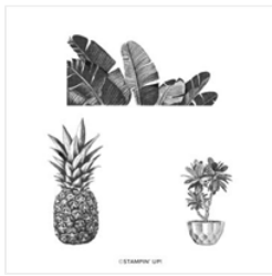
Island Vibes Cling Stamp Set - 158096

Judith Patterson judith@judithpatterson.net www.judithpatterson.net