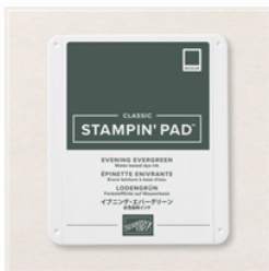
Evening Evergreen Classic Stampin' Pad - 155576