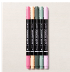
2021-2023 In Color Stampin' Write Markers - 155639