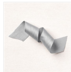
7/8" (2.2 Cm) Smoky Slate Textured Ribbon - 155813