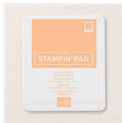
Pale Papaya Classic Stampin' Pad - 155670