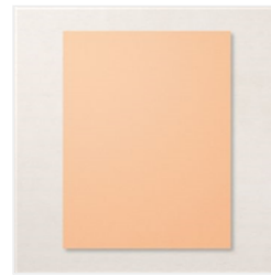
Pale Papaya 8-1/2" X 11" Cardstock - 155668