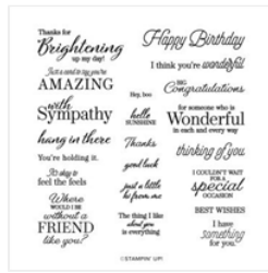
Special Moments Photopolymer Stamp Set (English) - 158081