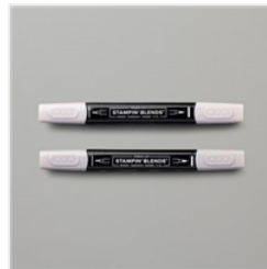
Gray Granite Stampin' Blends Combo Pack - 149537