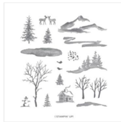
Snow Front Photopolymer Stamp Set - 150483