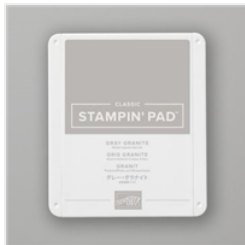
Gray Granite Classic Stampin' Pad - 147118