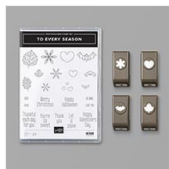
To Every Season Bundle (En) - 153051