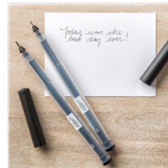
Journaling Pens - 145480