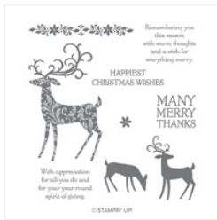
Dashing Deer Clear-Mount Stamp Set - 147728

https://itsastampthing-vicki.blogspot.com/