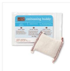
Embossing Buddy - 103083