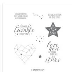
Little Twinkle Clear-Mount Stamp Set - 146452

angelstamps@hotmail.com angelstamps1.blogspot.com