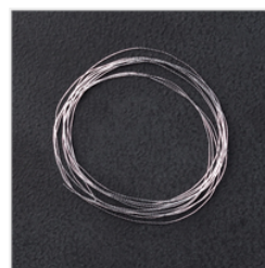
Silver Metallic Thread - 138402