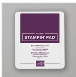
Blackberry Bliss Classic Stampin' Pad - 147092