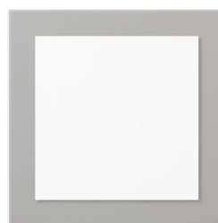
Whisper White 12" X 12" (30.5 X 30.5 Cm) Cardstock - 124302