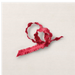
Real Red 3/8" (1 Cm) Mini Ruffled Ribbon - 156323