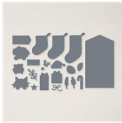
Stockings Dies - 156288

stampingwithmore@gmail.com http://www.stampingwithmore.com