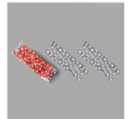
3" X 9" (7.6 X 22.9 Cm) Printed Gusseted Cellophane Bags - 151312