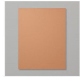
Cinnamon Cider 8- 1/2" X 11" Cardstock - 153078