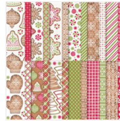
Gingerbread & Peppermint 6" X 6" (15.2 X 15.2 Cm) Designer Series Paper - 156313