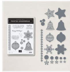
Frosted Gingerbread Bundle (English) - 156807