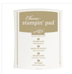
Crumb Cake Classic Stampin' Pad - 126975