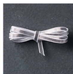
Silver 1/8" (3.2 Mm) Ribbon - 132137