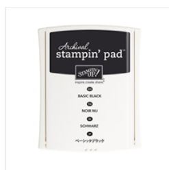
Basic Black Archival Stampin' Pad - 140931