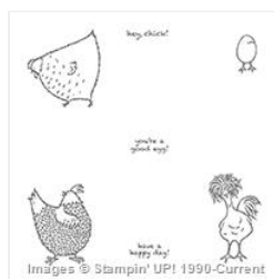
Hey Chick Clear Mount Stamp Set - 143331