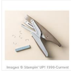
Handheld Stapler - 139083