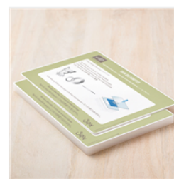
Big Shot Platform - 142802