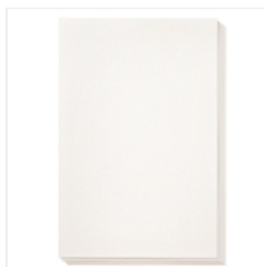
Watercolor Paper - 122959