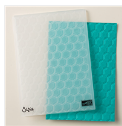
Hexagons Dynamic Textured Impressions Embossing Folder - 143231