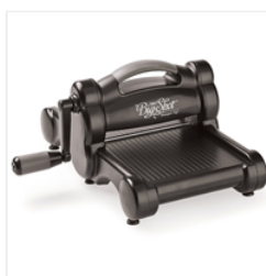
Big Shot - 143263