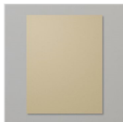
Crumb Cake 8-1/2" X 11" Cardstock - 120953