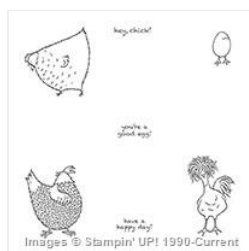
Hey Chick Wood- Mount Stamp Set - 143328