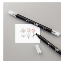
Blender Pens - 102845