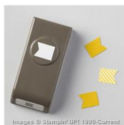
Banner Punch - 133519