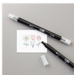
Blender Pens - 102845