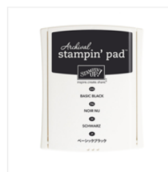
Basic Black Archival Stampin' Pad - 140931