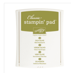
Old Olive Classic Stampin' Pad - 126953