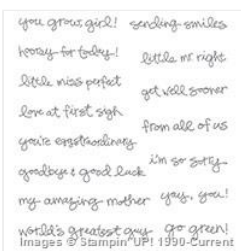
Greatest Greetings Clear-Mount Stamp Set - 140706