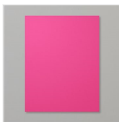
Melon Mambo 8- 1/2" X 11" Cardstock - 115320