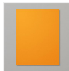
Pumpkin Pie 8-1/2" X 11" Cardstock - 105117