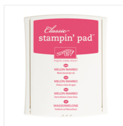
Melon Mambo Classic Stampin' Pad - 126948