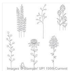
Flowering Fields Clear-Mount Stamp Set - 141303