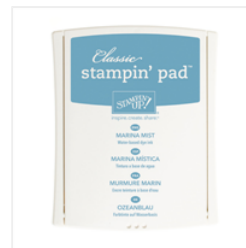
Marina Mist Classic Stampin' Pad - 126962