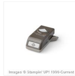
Project Life Corner Punch - 135346