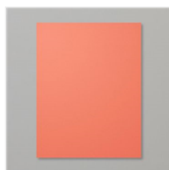
Calypso Coral 8- 1/2" X 11" Cardstock - 122925