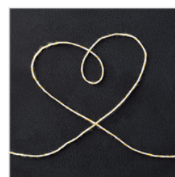
Crushed Curry Baker's Twine - 134586