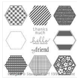
Six-Sided Sampler Clear-Mount Stamp Set - 130956