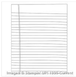
Writing Notes Clear-Mount Background Stamp - 139864

http://www.stampinup.net/esuite/home/stampingwithamanda