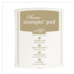
Crumb Cake Classic Stampin' Pad - 126975