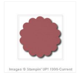
7/8" Scallop Circle Punch - 129404