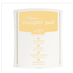
So Saffron Classic Stampin' Pad - 126957