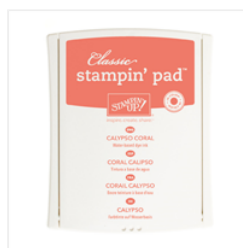
Calypso Coral Classic Stampin' Pad - 126983