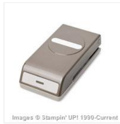
Word Window Punch - 119857