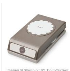
2-3/8" Scallop Circle Punch - 118874