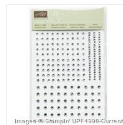
Rhinstone Basic Jewels - 119246