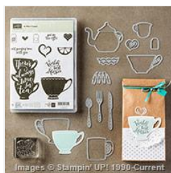
A Nice Cuppa Photopolymer Bundle - 141074