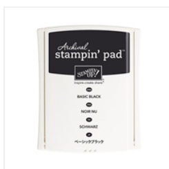
Basic Black Archival Stampin' Pad - 140931