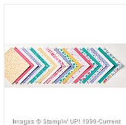
Have A Cuppa Designer Series Paper Stack - 140567