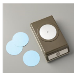
2" (5.1 Cm) Circle Punch - 133782