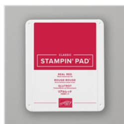
Real Red Classic Stampin' Pad - 147084