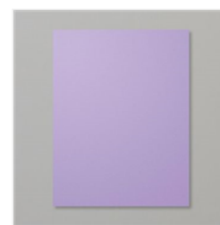
Highland Heather 8-1/2" X 11" Cardstock - 146986