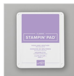
Highland Heather Classic Stampin' Pad - 147103