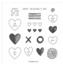
Sweet Conversations Photopolymer Stamp Set (English) - 157618