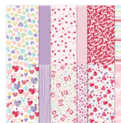
Sweet Talk 12" X 12" (30.5 X 30.5 Cm) Designer Series Paper - 157616