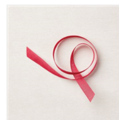
Real Red 3/8" (1 Cm) Faux Linen Ribbon - 158129