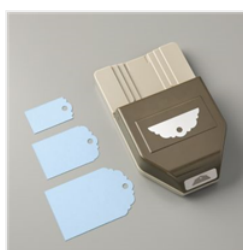
Delightful Tag Topper Punch - 149518