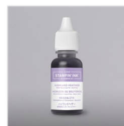
Highland Heather Classic Stampin' Ink Refill - 147167