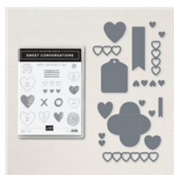
Sweet Conversations Bundle (English) - 157624