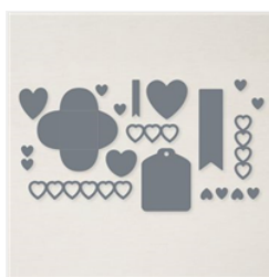
Sweet Hearts Dies - 157623