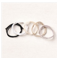
Baker's Twine Essentials Pack - 155475