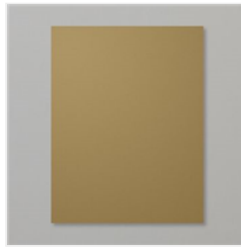
Soft Suede 8-1/2" X 11" Cardstock - 115318