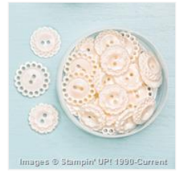
Very Vintage Designer Buttons - 129327