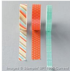
Retro Fresh This And That Washi Tape - 133001