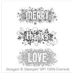
Seasonally Scattered Clear-Mount Stamp Set - 135023