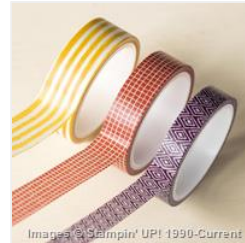
Color Me Autumn Designer Washi Tape - 135842