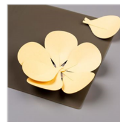
Silicone Craft Sheet - 127853