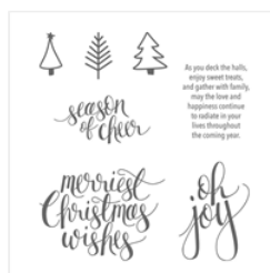
Watercolor Christmas Wood- Mount Stamp Set* - 144835