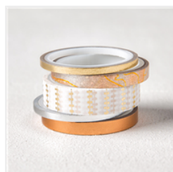
Year Of Cheer Specialty Washi Tape - 144644