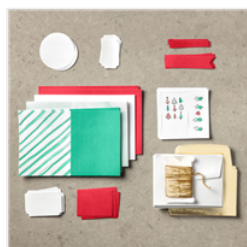
Watercolor Christmas Project Kit - 144649