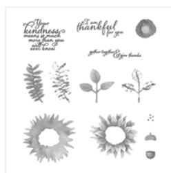
Painted Harvest Photopolymer Stamp Set - 144783

angelstamps@hotmail.com angelstamps1.blogspot.com