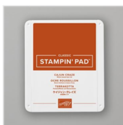
Cajun Craze Classic Stampin' Pad - 147085