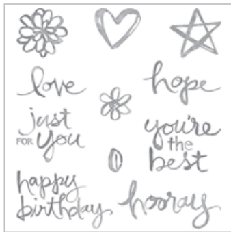
Watercolor Words Photopolymer Stamp