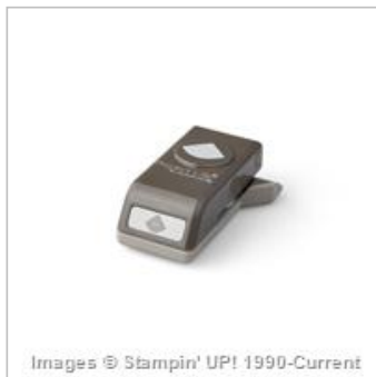
Project Life Corner Punch