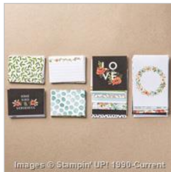
Hello Lovely Project Life Card Collection