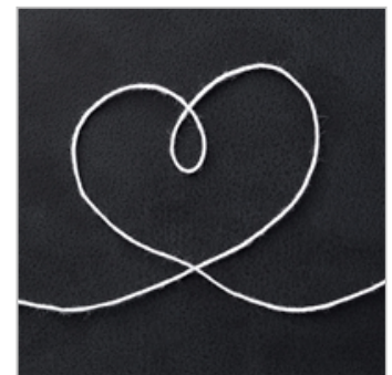
Whisper White Solid Baker's Twine