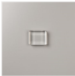
Clear Block B - 117147