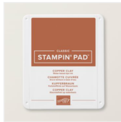
Copper Clay Classic Stampin' Pad - 161647