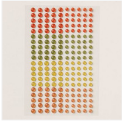
Faux Glass Dots - 164060