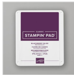
Blackberry Bliss Classic Stampin' Pad - 147092