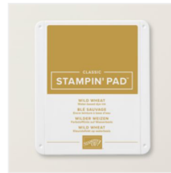
Wild Wheat Classic Stampin' Pad - 161651