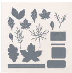
Autumn Leaves Dies - 162185