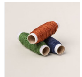
Natural Tones Linen Thread - 164071