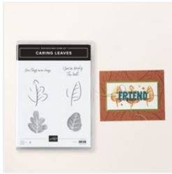
Caring Leaves Photopolymer Stamp Set (English) - 164273