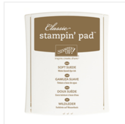
Soft Suede Classic Stampin' Pad - 126978