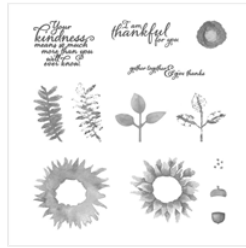
Painted Harvest Stamp Set - 144783