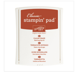
Cajun Craze Classic Stampin' Pad - 126965