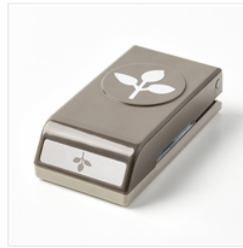
Leaf Punch - 144667