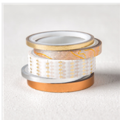
Year Of Cheer Specialty Washi Tape - 144644