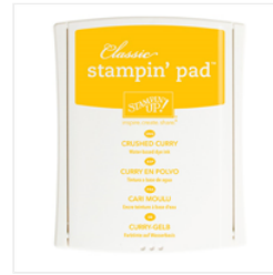
Crushed Curry Classic Stampin' Pad - 131173