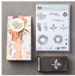
Painted Harvest Photopolymer Bundle* - 146021