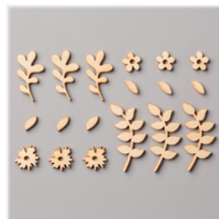
Touches Of Nature Elements - 144216