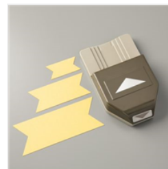
Triple Banner Punch - 138292