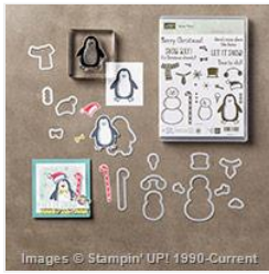
Snow Place Photopolymer Bundle - 140844

stampswellwithothers@gmail.com http://donnas-stampswellwithothers.blogspot.com/