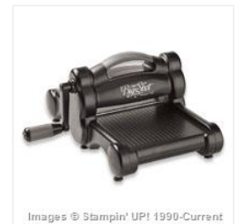
Big Shot - 113439