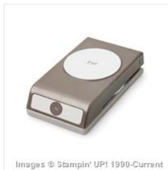
2-1/2" Circle Punch - 120906