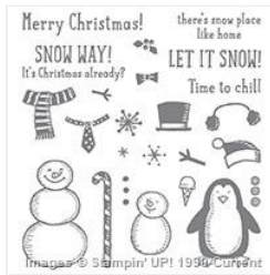
Snow Place Photopolymer Stamp Set - 139738