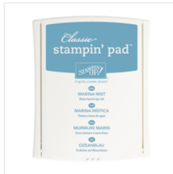
Marina Mist Classic Stampin' Pad - 126962