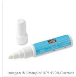
2-Way Glue Pen - 100425