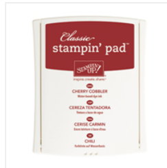
Cherry Cobbler Classic Stampin' Pad - 126966