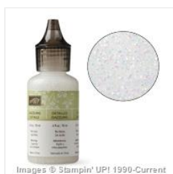
Dazzling Details - 124117