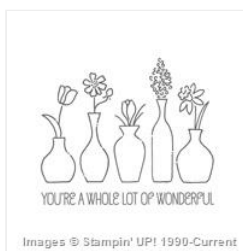
Vivid Vases Wood- Mount Stamp Set - 133818