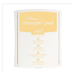
So Saffron Classic Stampin' Pad - 126957