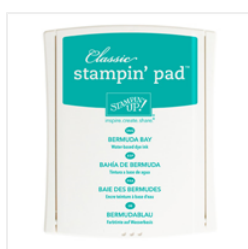
Bermuda Bay Classic Stampin' Pad - 131171