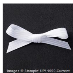
Whisper White 3/8" Stitched Satin Ribbon - 138429