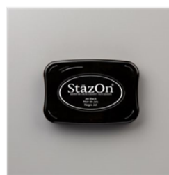
Jet Black Stazon Pad - 101406