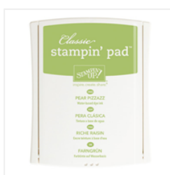
Pear Pizzazz Classic Stampin' Pad - 131180