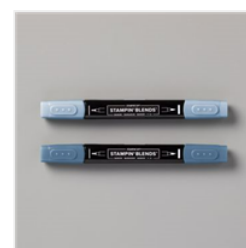
Misty Moonlight Stampin' Blends Combo Pack - 153108