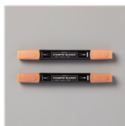
Cinnamon Cider Stampin' Blends Combo Pack - 153105