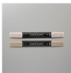
Crumb Cake Stampin' Blends Combo Pack - 154882