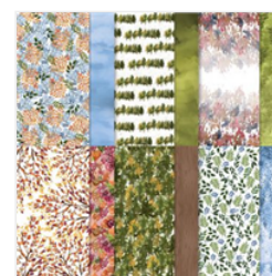
Beauty Of The Earth 12" X 12" (30.5 X 30.5 Cm) Designer Series Paper - 155841