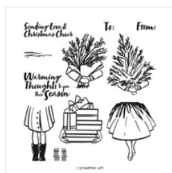
Delivering Cheer Photopolymer Stamp Set - 156368