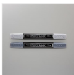
Basic Black Stampin' Blends Combo Pack - 154843