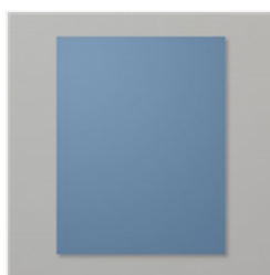
Misty Moonlight 8- 1/2" X 11" Cardstock - 153081