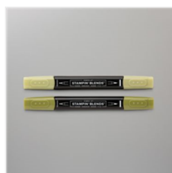
Old Olive Stampin' Blends Combo Pack - 154892