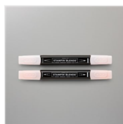
Petal Pink Stampin' Blends Combo Pack - 154893