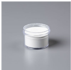
White Stampin' Emboss Powder - 109132