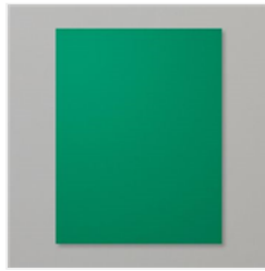
Shaded Spruce 8-1/2" X 11" Cardstock - 146981