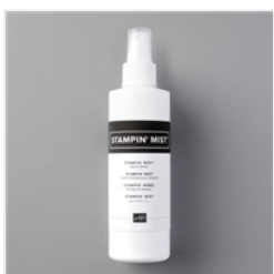
Stampin' Mist - 153648