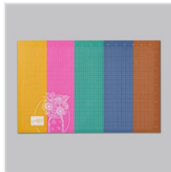
2020-2022 In Color Grid Paper - 155380