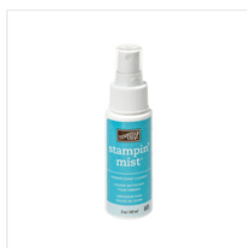
Stampin' Mist - 102394