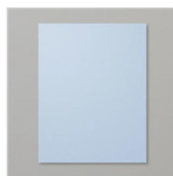
Seaside Spray 8-1/2" X 11" Cardstock - 150883