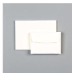
Very Vanilla Note Cards & Envelopes - 144236