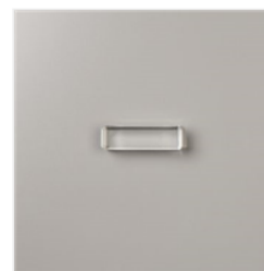
Clear Block G - 118489