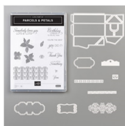
Parcels & Petals Bundle - 151107