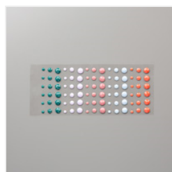
2019-2021 In Color Faceted Dots - 149607