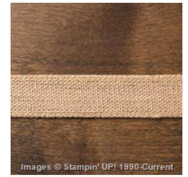
1-1/4" Burlap Ribbon - 132140