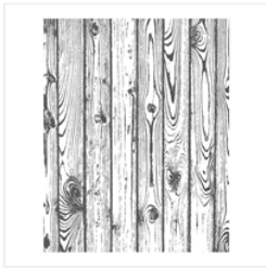
Hardwood Clear-Mount Stamp - 133035