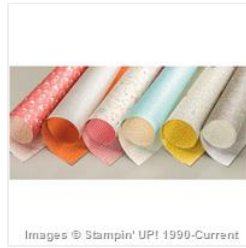
Sweet Li'l Things Designer Series Paper - 138447