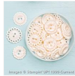
Very Vintage Designer Buttons - 129327