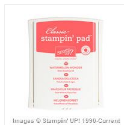
Watermelon Wonder Classic Stampin' Pad - 138323