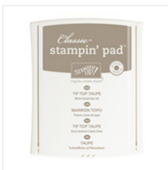
Tip Top Taupe Classic Stampin' Pad - 138325