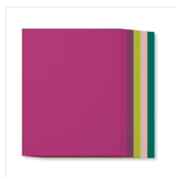
2017-2019 In Color 8-1/2" X 11" Cardstock - 144247