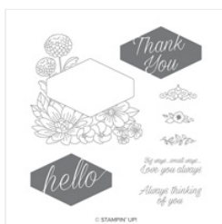
Accented Blooms Clear-Mount Stamp Set - 146681