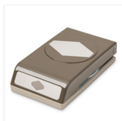
Tailored Tag Punch - 145667