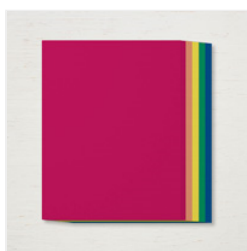
In Color 2018-2020 8-1/2" X 11" Cardstock - 146973