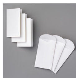
Whisper White Narrow Note Cards & Envelopes - 145583