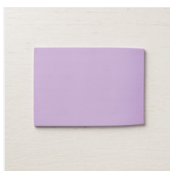
Simply Shammy - 147042