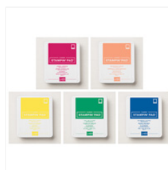
Classic Stampin' Pad Assortment In Color 2018-2020 - 147153