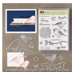
Best Birds Photopolymer Bundle - 142315