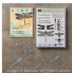
Dragonfly Dreams Photopolymer Bundle - 144728