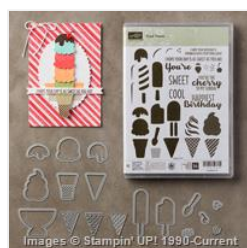
Cool Treats Photopolymer Bundle - 145181