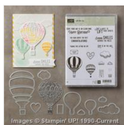
Lift Me Up Clear-Mount Bundle - 144712