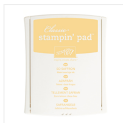
So Saffron Classic Stampin' Pad - 126957