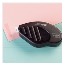
Fast Fuse Adhesive - 129026