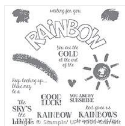
Over The Rainbow Photopolymer Stamp Set - 138770