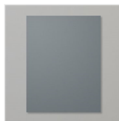
Basic Gray 8-1/2" X 11" Cardstock - 121044