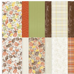
Gathering Together 12" X 12" (30.5 X 30.5 Cm) Specialty Designer Series Paper - 165969