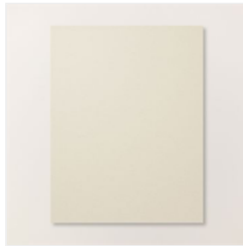
Basic Beige 8-1/2" X 11" Cardstock - 164511