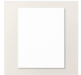
Basic White 8-1/2" X 11" Cardstock - 166780