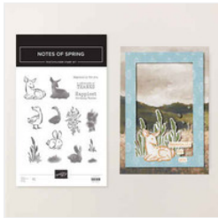
Notes Of Spring Photopolymer Stamp Set (English) - 167979

ds52wood@gmail.com www.susiewood.stampinup.net