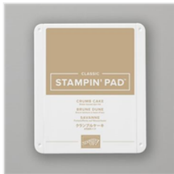
Crumb Cake Classic Stampin' Pad - 147116