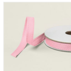
Pretty In Pink 3/8 (1 Cm) Bordered Ribbon - 163784