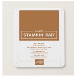
Pecan Pie Classic Stampin' Pad - 161665