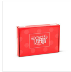
Prepaid Paper Pumpkin Subscription 1-Month - 137858