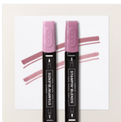
Moody Mauve Stampin' Blends Combo Pack - 161660