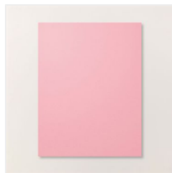
Pretty In Pink 8-1/2 X 11 Cardstock - 163793