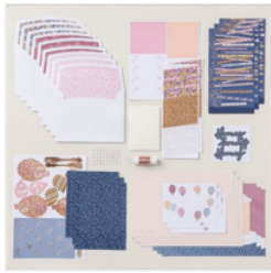
Time For Cake Paper Pumpkin Refill - 165076