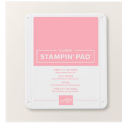
Pretty In Pink Classic Stampin Pad - 163807