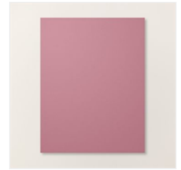
Moody Mauve 8-1/2 X 11 Cardstock - 161723