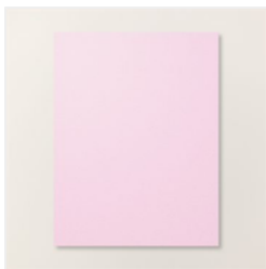
Bubble Bath 8-1/2 X 11 Cardstock - 161718