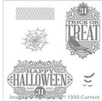
Witches' Night Photopolymer Stamp Set