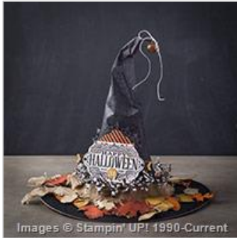
Witching Décor Project Kit