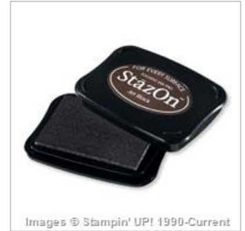
Jet Black Stazon Pad