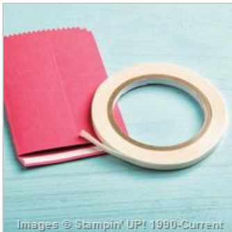
Tear & Tape Adhesive