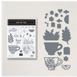
Cup Of Tea Bundle (English) - 158667

Judith Patterson judith@judithpatterson.net www.judithpatterson.net