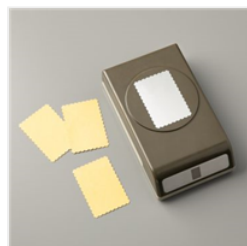
Rectangular Postage Stamp Punch - 152709