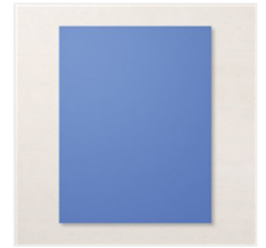
Orchid Oasis 8- 1/2" X 11" Cardstock - 159267