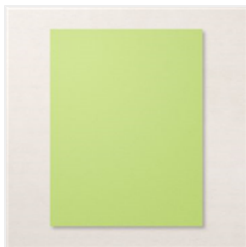
Parakeet Party 8- 1/2" X 11" Cardstock - 159259