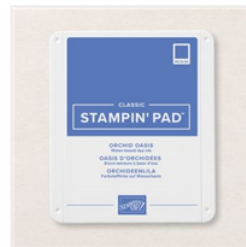
Orchid Oasis Classic Stampin' Pad - 159214