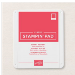
Sweet Sorbet Classic Stampin' Pad - 159216