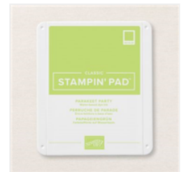
Parakeet Party Classic Stampin' Pad - 159208