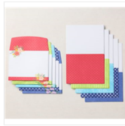
Tea Boutique Cards & Envelopes - 159270