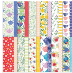
Tea Boutique 6" X 6" (15.2 X 15.2 Cm) Designer Series Paper - 158659