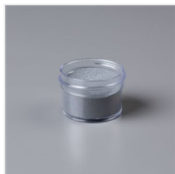
Silver Stampin' Emboss Powder - 109131