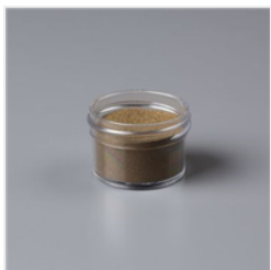
Gold Stampin' Emboss Powder - 109129