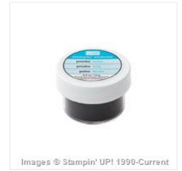
Black Stampin' Emboss Powder - 109133