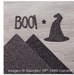
Black Glimmer Paper - 139605