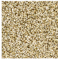
Gold Glimmer Paper - 133719