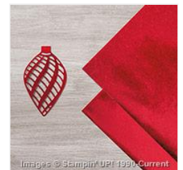
Red Foil Sheets - 139607