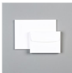
Whisper White Note Cards & Envelopes - 131527