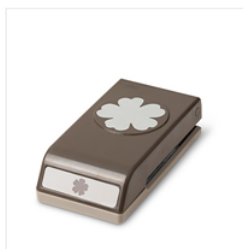
Pansy Punch - 130698