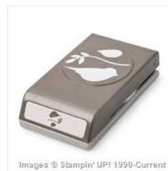
Bird Builder Punch - 117191