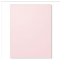
Pink Pirouette A4 Cardstock - 116203