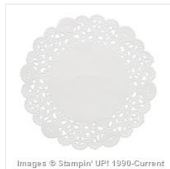
Tea Lace Paper Doilies - 129399