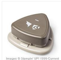
Curvy Corner Trio Punch - 139683