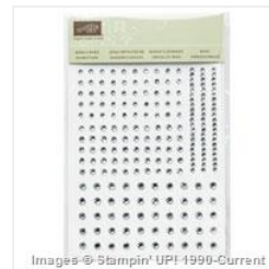
Rhinstone Basic Jewels - 119246