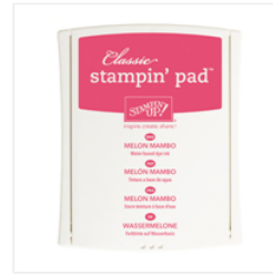
Melon Mambo Classic Stampin' Pad - 126948