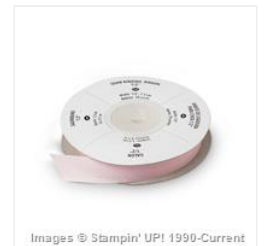
Pink Pirouette 1/2" Seam Binding Ribbon - 134574