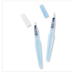
Aqua Painters - 103954