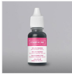
Melon Mambo Classic Stampin' Ink Refill - 115662