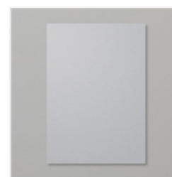
Smoky Slate A4 Cardstock - 131291