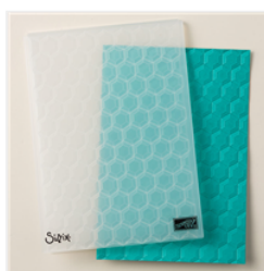
Hexagons Dynamic Textured Impressions Embossing Folder - 143231