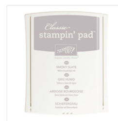
Smoky Slate Classic Stampin' Pad - 131179