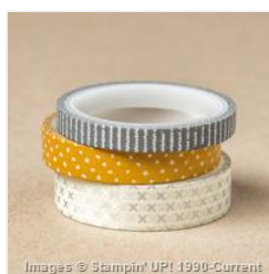
Urban Underground Designer Washi Tape - 142787