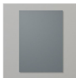
Basic Gray A4 Cardstock - 121689