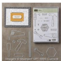
Nailed It Clear-Mount Bundle - 144735

https://craftydukydoodah.blogspot.co.uk/