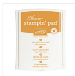
Delightful Dijon Classic Stampin' Pad - 138327