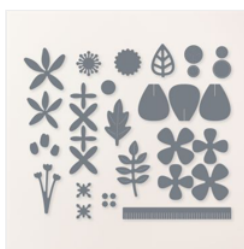
Paper Florist Dies - 161284