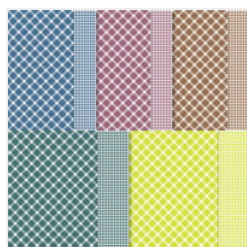
Glorious Gingham 6" X 6" (15.2 X 15.2 Cm) Designer Series Paper - 163170