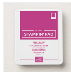
Berry Burst Classic Stampin' Pad - 147143