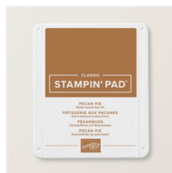
Pecan Pie Classic Stampin' Pad - 161665