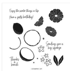
Sweet Citrus Photopolymer Stamp Set (English) - 160641

stampingwithmore@gmail.com http://www.stampingwithmore.com