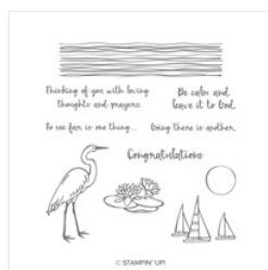
Lilypad Lake Clear-Mount Stamp Set - 146496