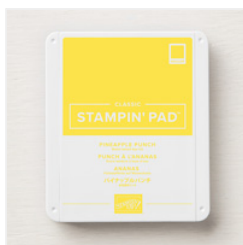
Pineapple Punch Classic Stampin' Pad - 147141