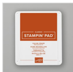
Cajun Craze Classic Stampin' Pad - 147085