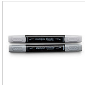
Smoky Slate Stampin' Blends Markers Combo Pack