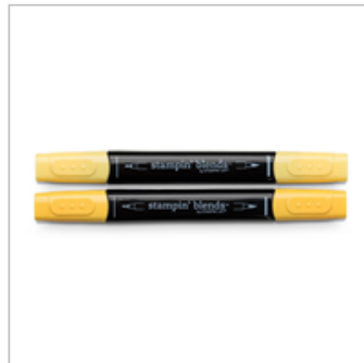
Daffodil Delight Stampin' Blends Markers Combo Pack