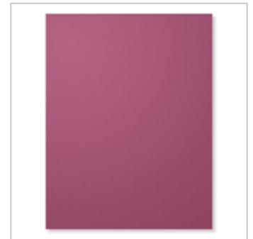
Rich Razzleberry 8- 1/2" X 11" Cardstock