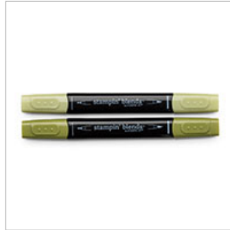
Old Olive Stampin' Blends Markers Combo Pack