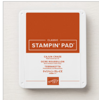
Cajun Craze Classic Stampin' Pad