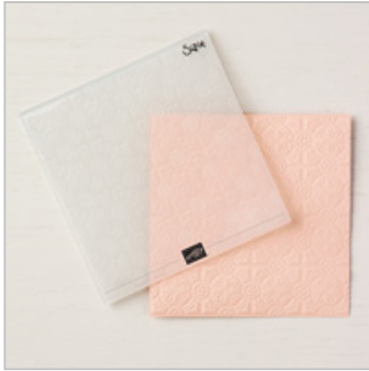
Tin Tile Dynamic Textured Impressions Embossing Folder