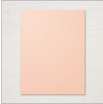
Petal Pink 8-1/2" X 11" Cardstock