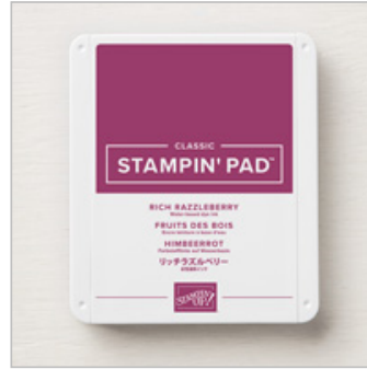
Rich Razzleberry Classic Stampin' Pad