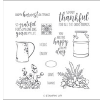
Country Home Photopolymer Stamp Set