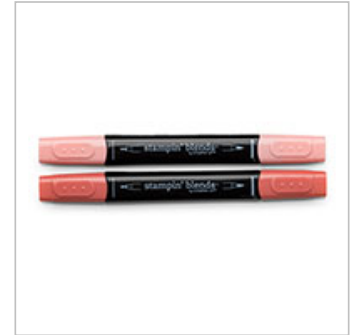
Calypso Coral Stampin' Blends Markers Combo Pack