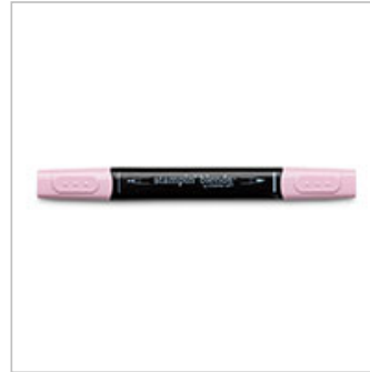
Pink Pirouette Dark Stampin' Blends Marker