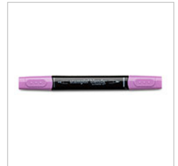
Rich Razzleberry Light Stampin' Blends Marker