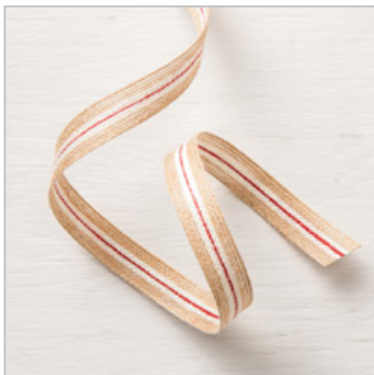
5/8" (1.6 Cm) Striped Burlap Trim