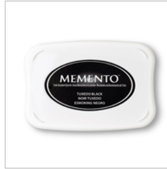
Tuxedo Black Memento Ink Pad