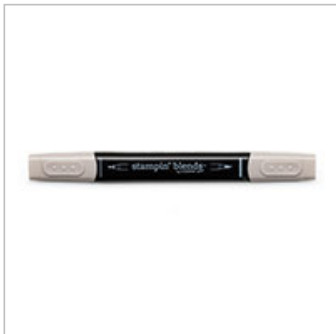
Crumb Cake Light Stampin' Blends Marker