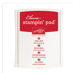
Real Red Classic Stampin' Pad - 126949