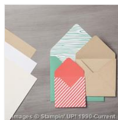
Neutrals Envelope Paper - 138310