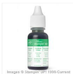
Cucumber Crush Classic Stampin' Ink Refill - 138329

stampwithmarybush@yahoo.com www.stampinthesand.stampinup.net