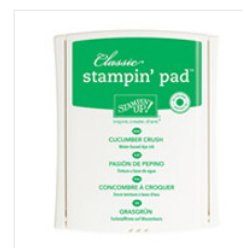
Cucumber Crush Classic Stampin' Pad - 138324