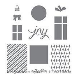
Your Presents Wood-Mount Stamp Set - 139803

stampwithmarybush@yahoo.com www.stampinthesand.stampinup.net