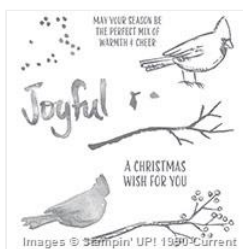
Joyful Season Photopolymer Stamp Set - 139770