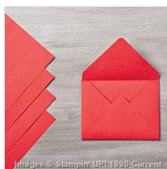
Real Red Envelope Paper - 139604