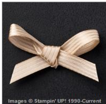
Crumb Cake 3/8" Stitched Satin Ribbon