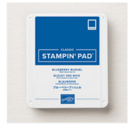
Blueberry Bushel Classic Stampin' Pad - 147138