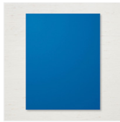
Blueberry Bushel 8-1/2" X 11" Cardstock - 146968