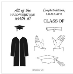
Cap & Gown Cling Stamp Set (English) - 162810