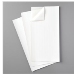
Adhesive Sheets - 152334