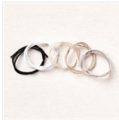
Baker's Twine Essentials Pack - 155475