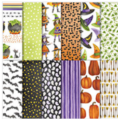
Toil & Trouble 12" X 12" (30.5 X 30.5 Cm) Designer Series Paper - 147531