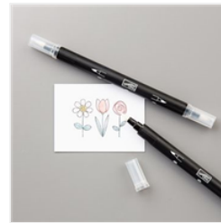
Blender Pens - 102845