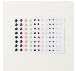
Faceted Dots - 146910