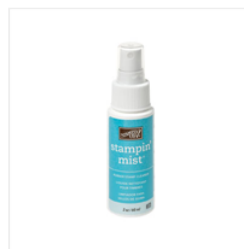
Stampin' Mist - 102394