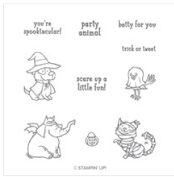
Stamp Set Clear Trick Or Tweet - 147722

angelstamps@hotmail.com angelstamps1.blogspot.com