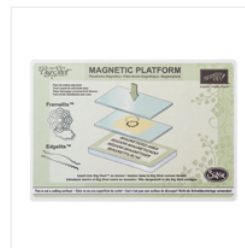
Magnetic Platform - 130658