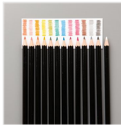
Watercolor Pencils - 141709