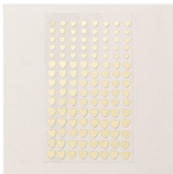
Adhesive-Backed Heart Sequins - 164920