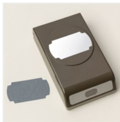
Labeled With Love Punch - 163569