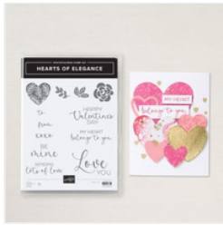
Hearts Of Elegance Photopolymer Stamp Set (English) - 164909