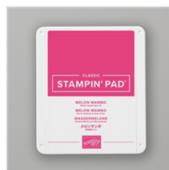
Melon Mambo Classic Stampin' Pad - 147051