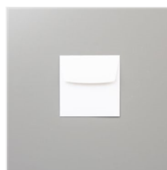
Whisper White 3" X 3" (7.6 X 7.6 Cm) Envelopes - 145829