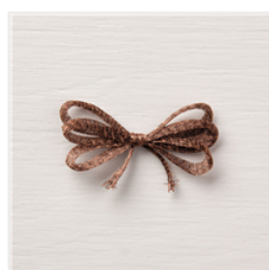
1/4" Copper Trim - 144179