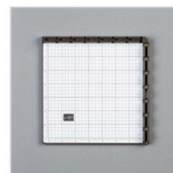
Stamparatus - 146276