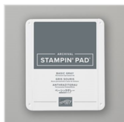
Basic Gray Classic Stampin' Pad - 149165