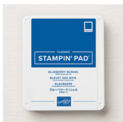
Blueberry Bushel Classic Stampin' Pad - 147138