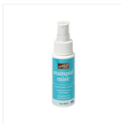
Stampin' Mist - 102394