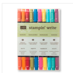
Brights Stampin' Write Markers - 131259