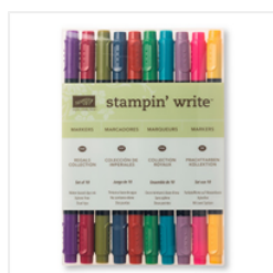
Regals Stampin' Write Markers - 131262