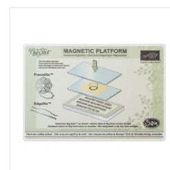
Magnetic Platform - 130658