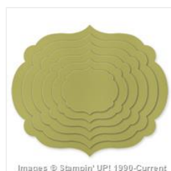
Labels Collection Framelits Die - 125598