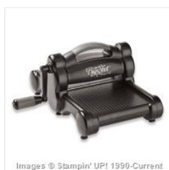
Big Shot - 113439