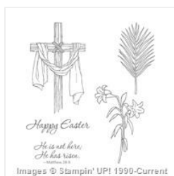
Easter Message Clear-Mount Stamp Set - 142987

http://creativemeasuresbytiffany.blogspot.com/