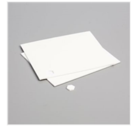
Stampin' Dimensionals - 104430 Price: $5.00