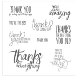
All Things Thanks Clear-Mount Stamp Set - 143097 Price: $19.00