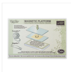
Magnetic Platform - 130658