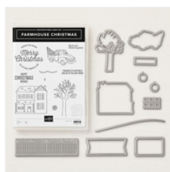
Farmhouse Christmas Photopolymer Bundle - 149941