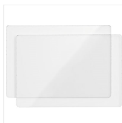
Standard Cutting Pads - 113475