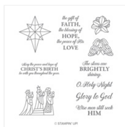
Illuminated Christmas Clear- Mount Stamp Set - 147833