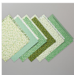
Garden Lane Designer Series Paper - 149488