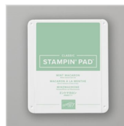
Mint Macaron Classic Stampin' Pad - 147106