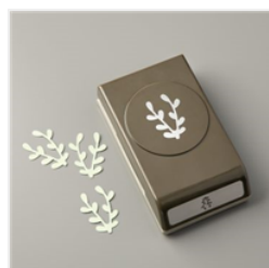
Sprig Punch - 148012