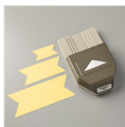
Triple Banner Punch - 138292