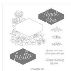
Accented Blooms Clear-Mount Stamp Set - 146681