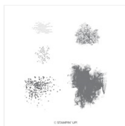
Artisan Textures Wood-Mount Stamp Set - 146570