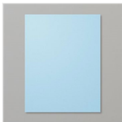
Balmy Blue 8-1/2" X 11" Cardstock - 146982