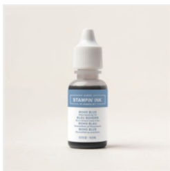
Boho Blue Classic Stampin' Ink Refill - 161656