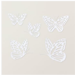
Paper Butterfly Accents - 162612