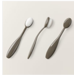
Small Blending Brushes - 160518