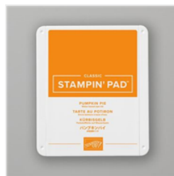
Pumpkin Pie Classic Stampin' Pad - 147086