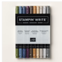
Neutrals Stampin' Write Markers - 161697