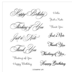
Go To Greetings Cling Stamp Set (English) - 158763