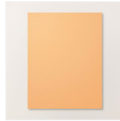
Peach Pie 8-1/2" X 11" Cardstock - 163799