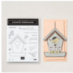
Country Birdhouse Photopolymer Stamp Set (English) - 163395