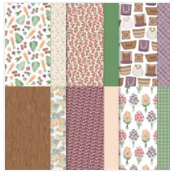
To Market 12" X 12" (30.5 X 30.5 Cm) Designer Series Paper - 163421