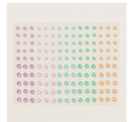
2024-2026 In Color™ Shimmer Gems - 163781