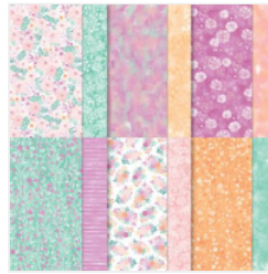
Unbounded Beauty 12" X 12" (30.5 X 30.5 Cm) Designer Series Paper - 163372