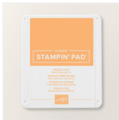
Peach Pie Classic Stampin Pad - 163810