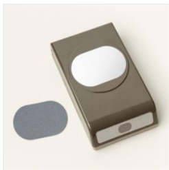
Modern Oval Punch - 162234