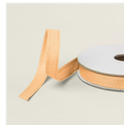
Peach Pie 3/8" (1 Cm) Bordered Ribbon - 163783