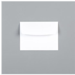
Whisper White Medium Envelopes