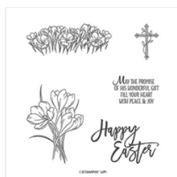
Easter Promise Cling Stamp Set (English) - 151544