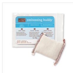
Embossing Buddy - 103083