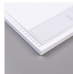
Grid Paper - 130148