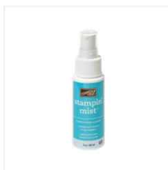
Stampin' Mist - 102394