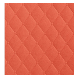
Tufted 3D Embossing Folder - 151785