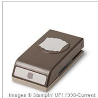
Artisan Label Punch