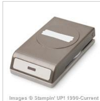
Modern Label Punch