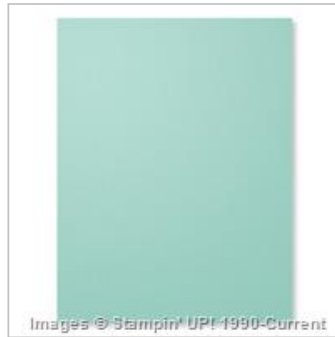
Coastal Cabana 8- 1/2" X 11" Card Stock