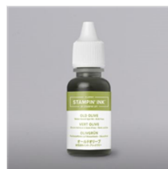
Old Olive Classic Stampin' Ink Refill - 100531