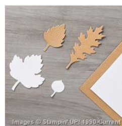
Kraft And White Corrugated Paper - 138317