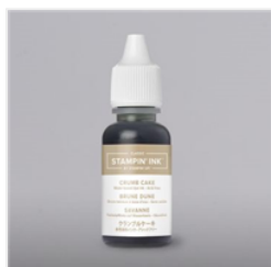
Crumb Cake Classic Stampin' Ink Refill - 121029