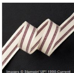
Blackberry Bliss 5/8" Striped Cotton Ribbon - 138421