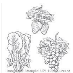
Market Fresh Clear-Mount Stamp Set - 139344