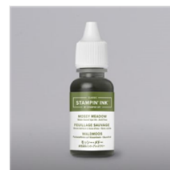
Mossy Meadow Classic Stampin' Ink Refill - 133651