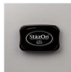
Jet Black Stazon Pad - 101406