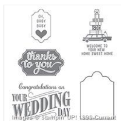
Happy Notes Clear-Mount Stamp Set - 139336